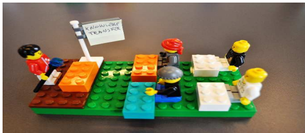
Figure 1: “Knowledge transfer”, a model built during a LLED session